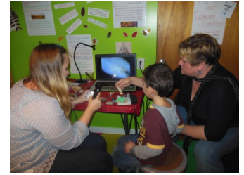
Checking out the Scope on a Rope

The next "MicroShow!" will be held at the museum on Wednesday August 14th at 2:00.